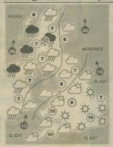
Situation at noon today

preshed the van to its usual partiting position.