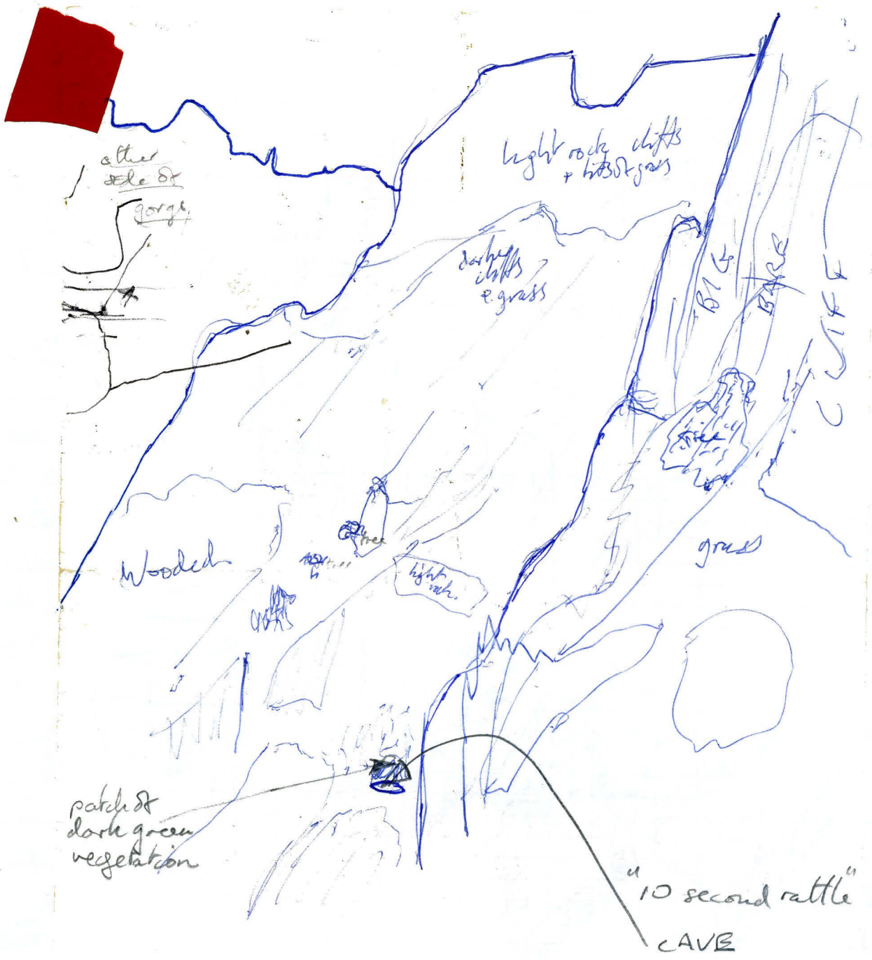
As seen from grassy ridge to right of Tria path.